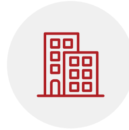
Commercial & Industrial Valuations